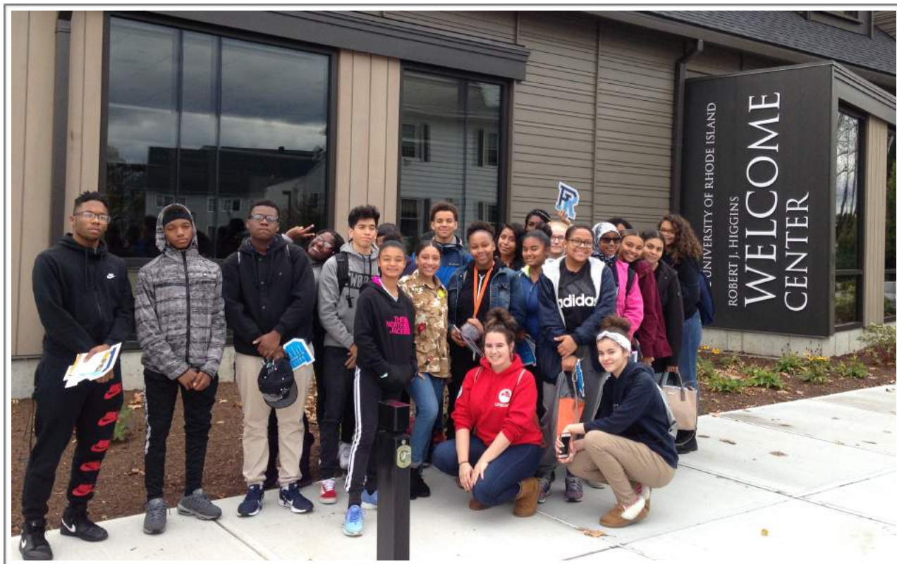
Students in front of the University of Rhode Island during a college tour.