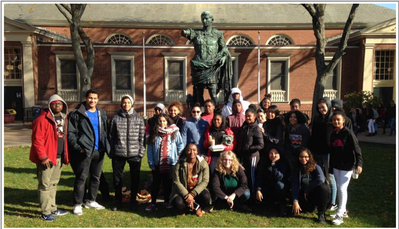
UBMS students on a tour of Brown University in November.