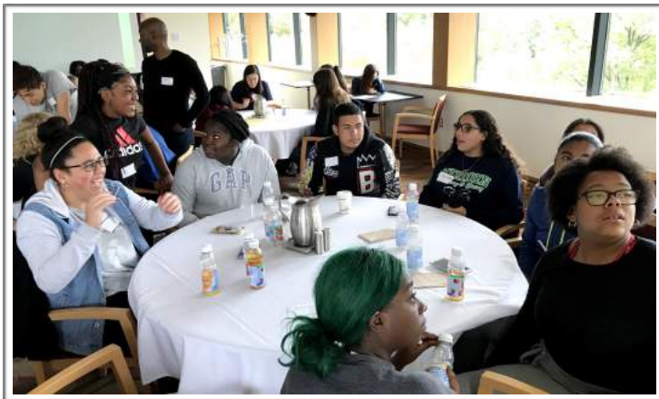
Our students listening to other presenters at the PIE Brunch.

In October , UBMS was involved in the second annual PIE Brunch. PIE stands for Pathways to Inclusive Education, which includes programs such as, Upward Bound, McNair, Mellon Mays, Posse, and WesMass, all of which are programs that serve underrepresented, low-income, and first-generation students at Wesleyan. At the Saturday Session, students split up into groups to collaborate with Wesleyan students to brainstorm and present their ideas for another PIE event with a small budget. Students got really creative and later voted for the best event idea, which will come to life in the spring semester! Check out the images below.