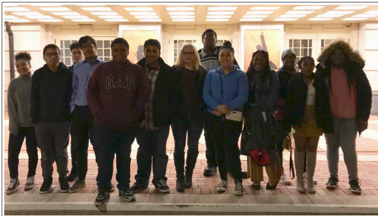
Students outside of the Bushnell Theater in Hartford, CT after seeing Neil DeGrasse Tyson.